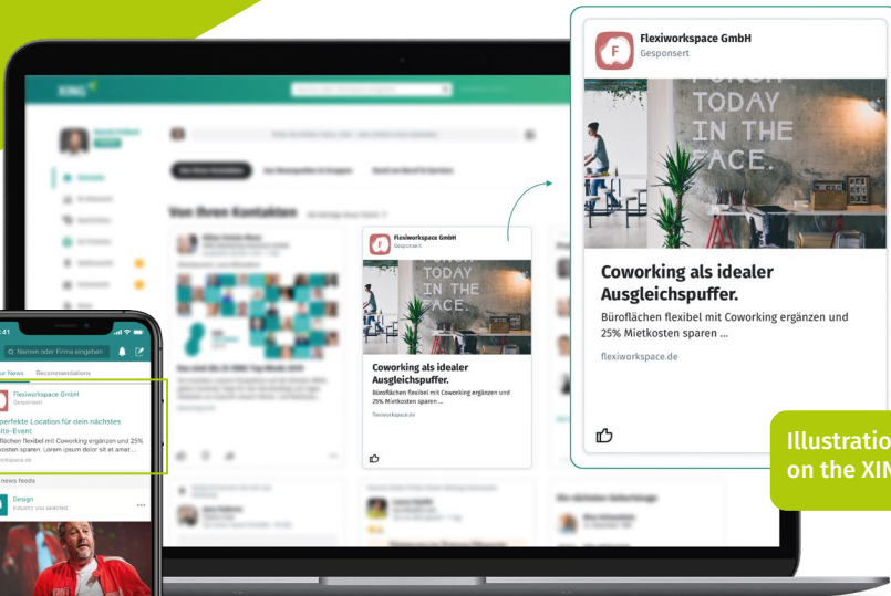
Illustration of XING Ads on the XING homepage

Are you looking to draw more visitors to your corporate website, campaign landing page, employer news or Company Profile. Boost your reach with XING Ads – ads that are displayed on the XING start page. You can also use them to promote your website, group, or event among a specific target audience on XING.